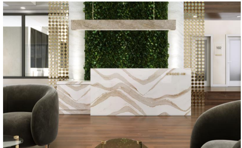
Brittanicca Gold Cool™

Brittanicca Gold Cool™ is flowing with multi-hued streams of copper gold, fog, and translucent greige that course through the grand design. Accompanied by wisps and ribbons of warm earth tones against a crisp, cool background, the design has the flexibility to go cool or warm and is part of Cambria's Brittanicca™ designs. Set against a stark background, its veining is one of the biggest colors of the year.